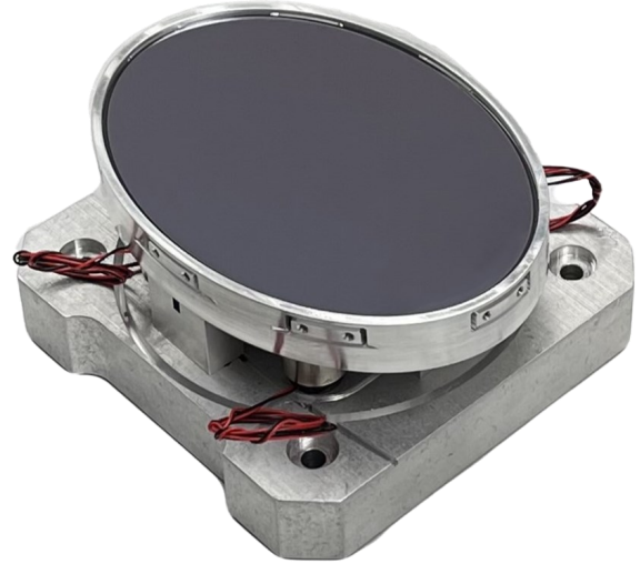
Elliptical VCA FSM (No Package Option)